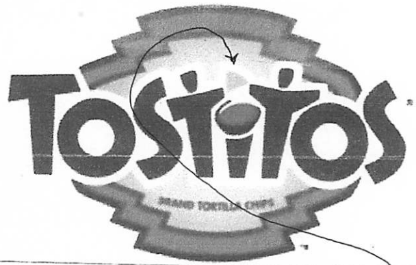
18. TWO GUYS DIPPING A CHIP