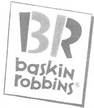
20. NUMBER 31