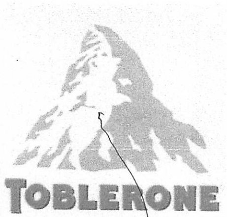
17. A BEAR