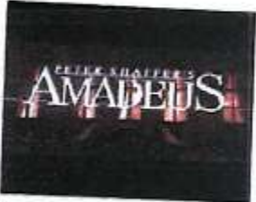
14. Amadeus, 1984