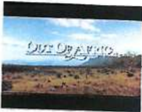
15. Out of Africa, 1985