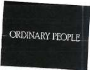
12. Ordinary People, 1980

12-16. For one point each, match the lead actor/actress with the academy award "best picture" in the year shown.