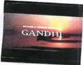
13. Gandhi, 1982