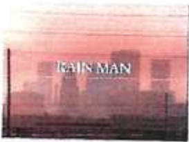
16. Rainman, 1988